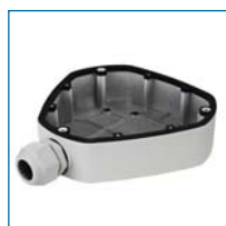
Réf. : VZ-1281ZJ-DM25