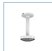
Réf. : VZ-1271ZJ-DM25