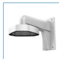
Réf. : VZ-1273ZJ-DM25