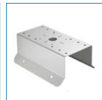
Réf. : VZ-1276ZJ