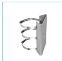
Réf. : VZ-1275ZJ