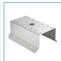
Réf. : VZ-1276ZJ