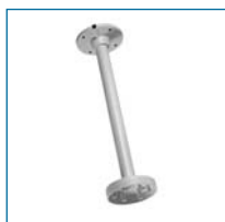
Réf. : VZ-1271ZJ-135