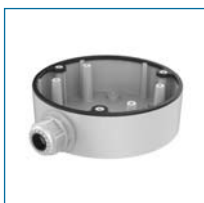
Réf. : VZ-1280ZJ-DM21