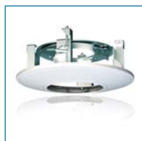
Réf. : VZ-1227ZJ