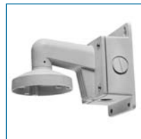
Réf. : VZ-1272ZJ-120B