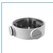
Réf. : VZ-1260ZJ

* -S (special order): 1-ch audio I/O interface, 1-ch alarm I/O interface.