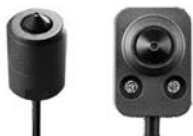
VZ-2CD6412FWD-10 cylindrique VZ-2CD6412FWD-20 carré