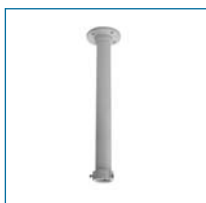
Réf. : VZ-1662ZJ