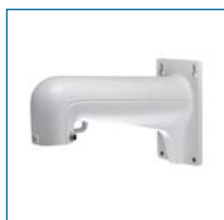
Réf. : VZ-1601ZJ