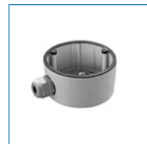
Réf. : VZ-1280ZJ-DM20