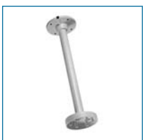
Réf. : VZ-1271ZJ-135