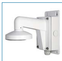
Réf. : VZ-1273ZJ-135B