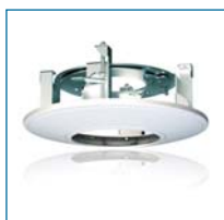
Réf. : VZ-1227ZJ